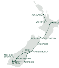
Discover New Zealand 14 Days/13 Nights Page 18