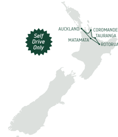
Coromandel and Rotorua 8 Days/7 Nights Page 9