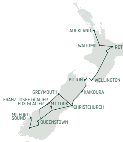
Best of New Zealand 15 Days/14 Nights Page 19