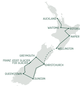
Stunning New Zealand 13 Days/12 Nights Page 18