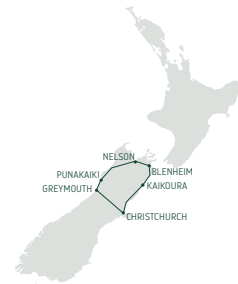
Top of the South 8 Days/7 Nights Page 12