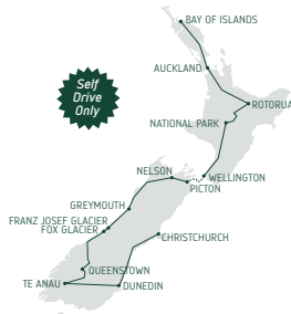
New Zealand Drivearound 20 Days/19 Nights Page 20