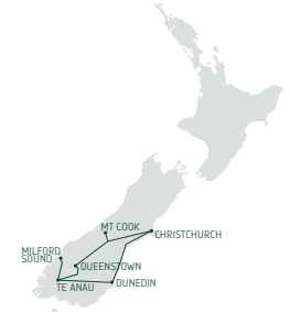
Wonderful South 7 Days/6 Nights Page 10