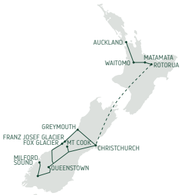
Majestic New Zealand 11 Days/10 Nights Page 17