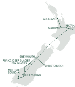
Scenic Splendour 9 Days/8 Nights Page 15