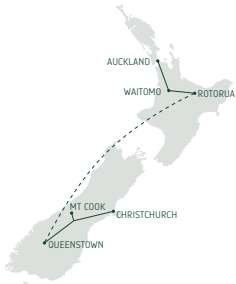
North South Highlights 7 Days/6 Nights Page 14

Please refer to www.kiwiway.com or your Kiwiway brochure for more details