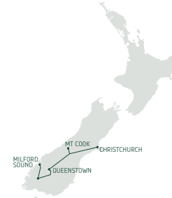
Southern Splendour 6 Days/5 Nights Page 10