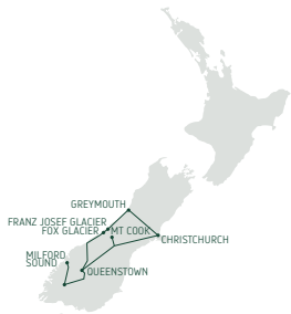
Fjords and Glaciers 8 Days/7 Nights Page 11