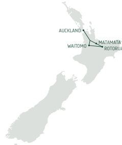
Thermal Wonder Special 5 Days/4 Nights Page 8