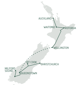
Enjoyable New Zealand 11 Days/10 Nights Page 16