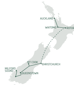
Essential New Zealand 10 Days/9 Nights Page 16