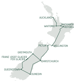
Charming New Zealand 12 Days/11 Nights Page 17