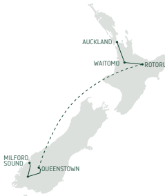
New Zealand Spectacular 7 Days/6 Nights Page 14