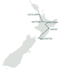
Northern Splendour 7 Days/6 Nights Page 9