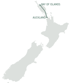
Northern Escape 5 Days/4 Nights Page 8