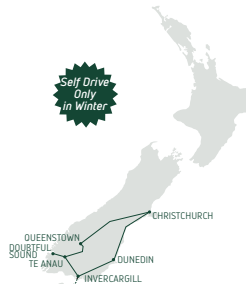
Bottom of the South 10 Days/9 Nights Page 13

Please refer to www.kiwiway.com or your Kiwiway brochure for more details