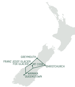
Lakes and Glaciers 9 Days/8 Nights Page 12