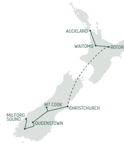
Essential New Zealand 10 Days/9 Nights Page 16