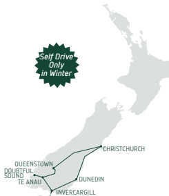
Bottom of the South 10 Days/9 Nights Page 13

Please refer to www.kiwiway.com or your Kiwiway brochure for more details