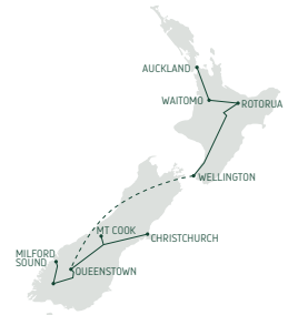
Enjoyable New Zealand 11 Days/10 Nights Page 16