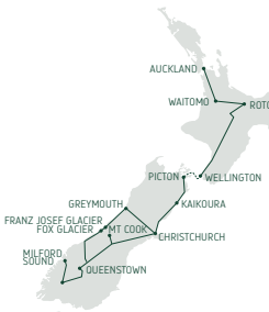
Best of New Zealand 15 Days/14 Nights Page 19