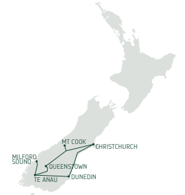
Wonderful South 7 Days/6 Nights Page 10