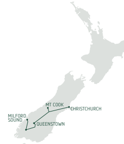
Southern Splendour 6 Days/5 Nights Page 10