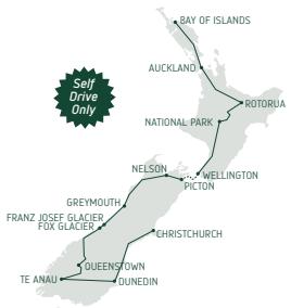
New Zealand Drivearound 20 Days/19 Nights Page 20